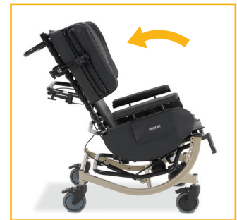
Front pivot seat tilt maintains a proper position for self-propulsion