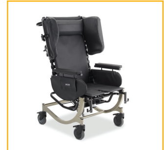
New frame design, including adjustable wings and tall back option