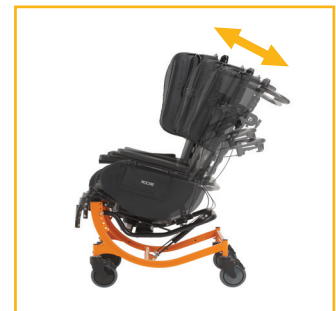
Optional dynamic rocking feature calms and creates contentment