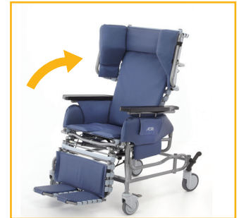
Tilt-in-Space functionality allows easy repositioning of users