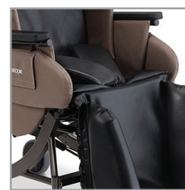
Padded Thigh Strap

Additional accessories available: foot supports, trays, and positioning straps