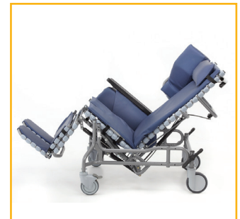
Removable armrests make transfers safer for caregivers and patients