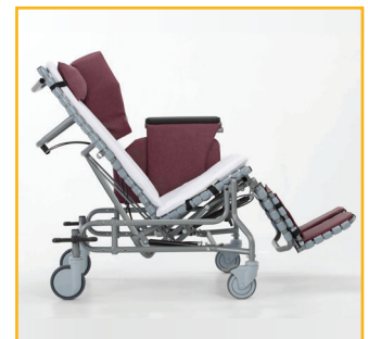
Posterior Tilt effectively opens the diaphragm improving digestion, oxygenation, and organ function