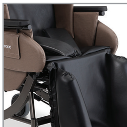
Padded Thigh Belt