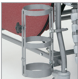
O 2 Holder