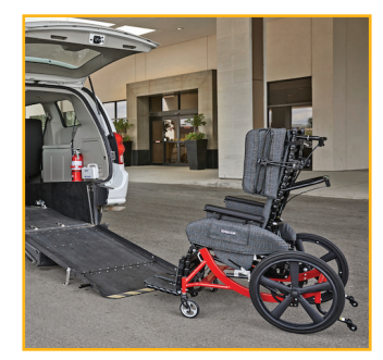
Easy to load in a variety of vehicles