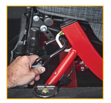
Brackets enable safe patient transport between locations