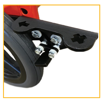
Heavy-Duty Wheel Upgrade includes wheel locks and wide front casters