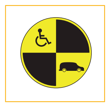
Crash-tested and WC-19 compliant for vehicle transport