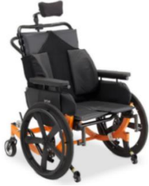
(shown with optional upgrades)