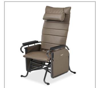
Auto-locking feature increases safety and prevents falls