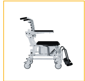
Features a range of simple adjustments for seat depth, wheel position, seat height, and more.