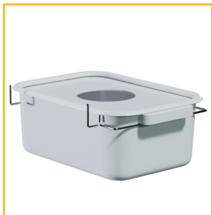
Commode pan with Basket