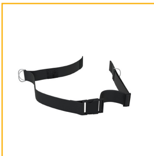
Pelvic Positioning Strap