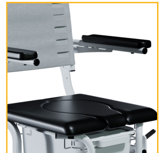
2-in-1 solid seat and commode is highly-versatile and easily mountable in all four directions