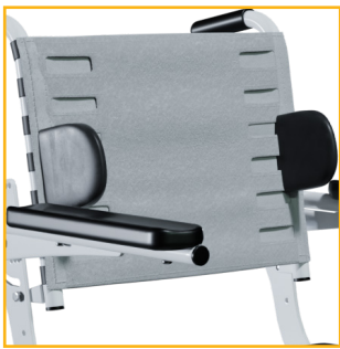
Molded Lateral Supports