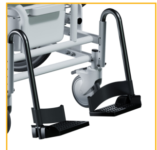
Fold-up arm supports and swing-away leg supports allow for easy bathing and transfers