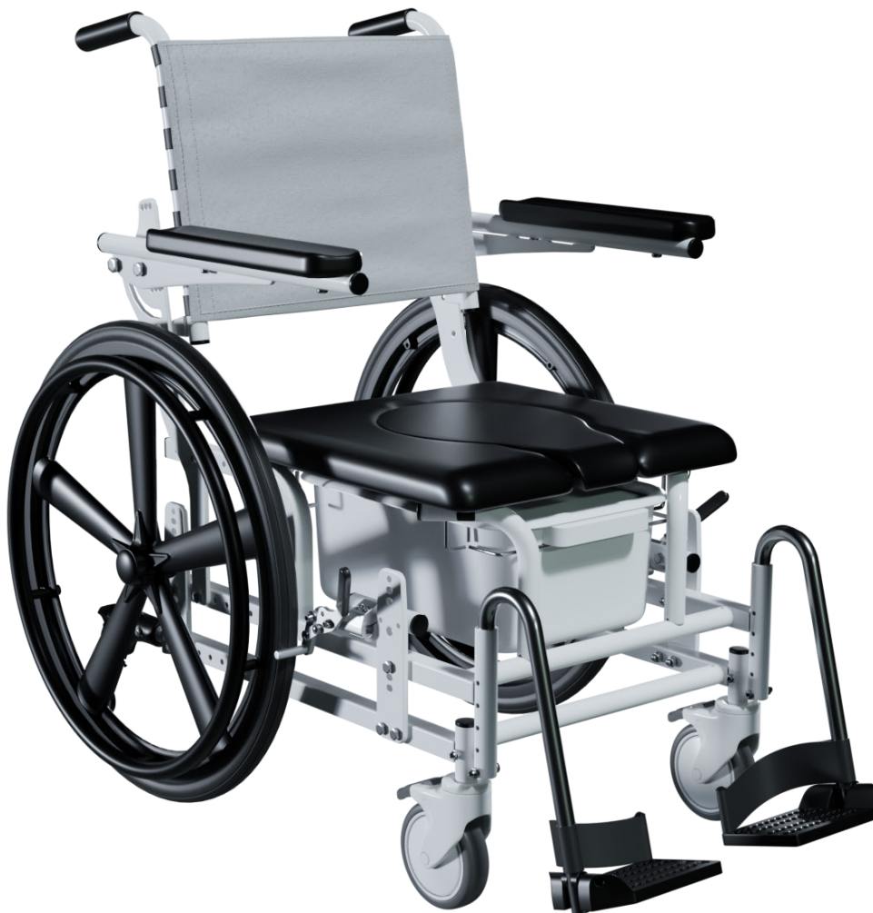
Shown with standard mag wheel configuration and optional commode pan and basket