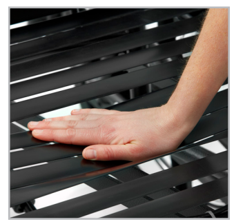
Comfort Tension Seating <sup>®</sup> improves postural support and sitting tolerance