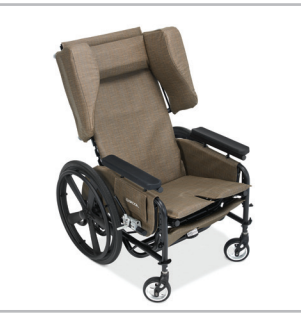
Front pivot seat tilt enhances visual orientation and encourages self-mobility with proper foot-on-floor positioning