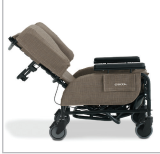
Posterior tilt aids in pressure redistribution