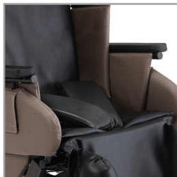
Padded Thigh Belt