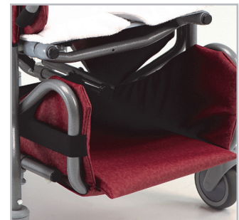
Optional contracture sling accommodates various levels of knee contractures