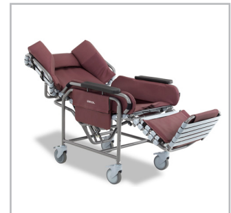
Tilt with semi-recline accommodates hip flexion limitations, allowing patients to be out of bed