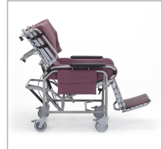
Posterior tilt aids in pressure redistribution