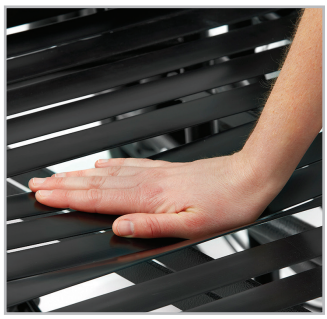
Comfort Tension Seating* increases support as well as sitting tolerance