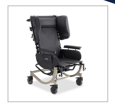
New frame design, including adjustable wings and tall back option