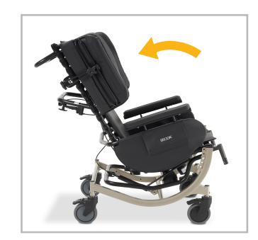
Front pivot seat tilt maintains a proper position for self-propulsion