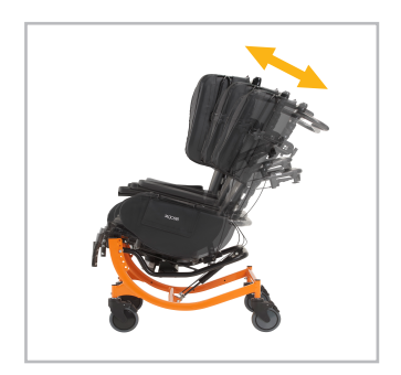
Optional dynamic rocking feature calms and creates contentment