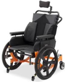
(shown with optional upgrades)