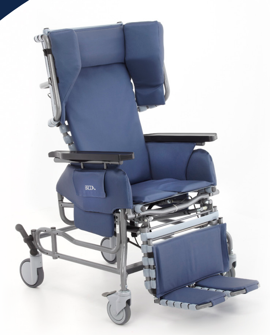
Shown with 6" Multi-Directional Locking Rear Casters, and long armrests options