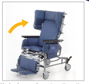
Tilt-in-Space functionality allows easy repositioning of users