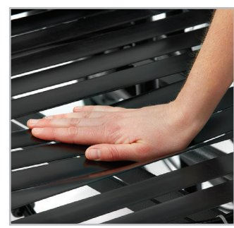
Comfort Tension Seating® increases support and sitting tolerance