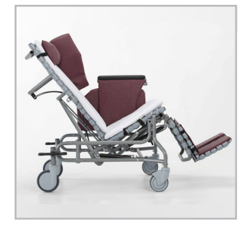
Posterior Tilt effectively opens the diaphragm improving digestion, oxygenation, and organ function