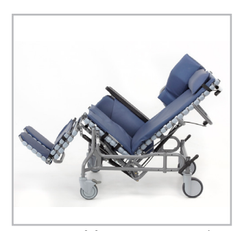
Removable armrests make transfers safer for caregivers and patients